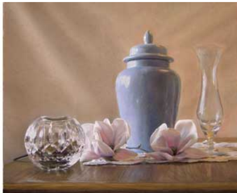
Magnolias Crystal and Blue 14" x 11"